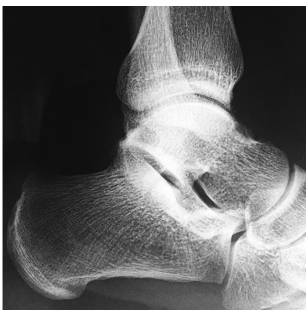
Figure 5. Postoperative Lateral X-ray; Proper Resection

After the surgical procedure, the patient was not immobilized and authorized to full weightbear according to pain control with elastic bandage. According to the Caprini DVT risk factor assessment score (score 1: minor surgery planned) (8, 18), it was decided not to use pharmacological DVT prophylaxis.