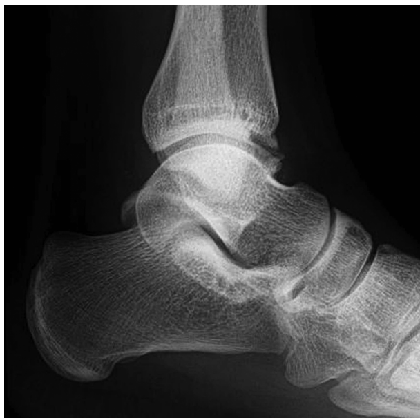
Figure 1. Lateral X-Ray Showing AP Impingement

+ and lupus anticoagulant -, as well as protein C or S deficiency, based on the evaluation of blood parameters. He previously had an ankle sprain while playing soccer. In the physical examination presented anterior (predominantly located anteromedially) and posterior ankle pain (positive ankle hyperflexion plantar test). The preoperatively AOFAS (the American orthopedic foot and ankle society score) (14) was 70. Radiological analysis showed an anterior ankle impingement type B (15) and a posterior impingement syndrome (posterior talar spur) (Figure 1).