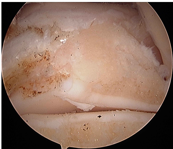
Figure 4. Posterior Endoscopy; Spur Resected