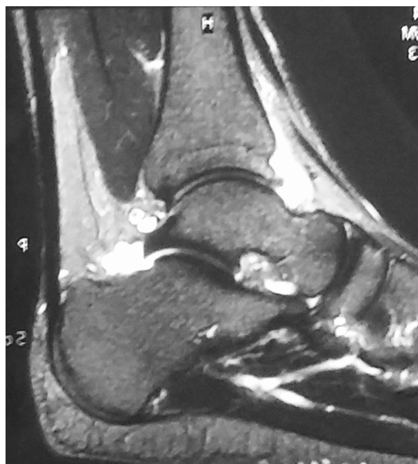
Figure 2. MRI; Ankle Synovitis and FHL Tenosynovitis

The patient received lumbar spinal anesthesia and placed in the supine position with a thigh tourniquet without any distraction technique. First, an anterior ankle arthroscopy was performed through the 2 standard anteromedial and anterolateral portals (5) to perform the debridement of osteophytes (Figure 3) and hypertrophic synovial in the anterior ankle (4.0 mm; 30 degrees; Storz). The duration of surgery was 25 minutes. Then, the patient was placed in prone position and a hindfoot endoscopy