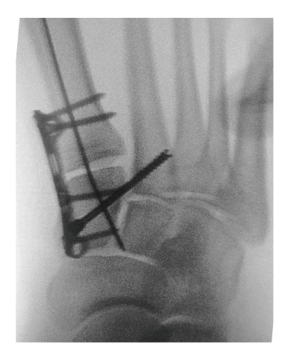
FIGURE 2: End fluoroscopic control prior to removal of the K wire.

Thus, an anatomical position of the medial and middle columns is obtained without tarsometatarsal joint involvement (Figures 3 and 4). Finally the K wire is removed.