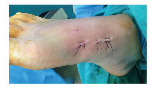
FIGURE 3: Clinical result after MIS Lisfranc bridge plating.

According to the radiological criteria established, the joint reduction was anatomical in four patients, almost anatomical in one patient (#4), and nonanatomical in none of the